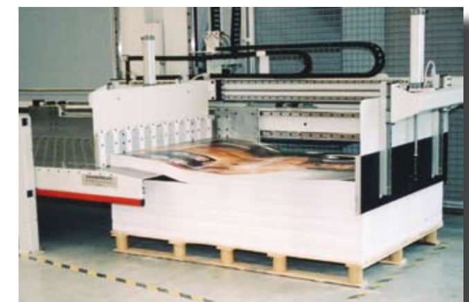
Restacker in operation