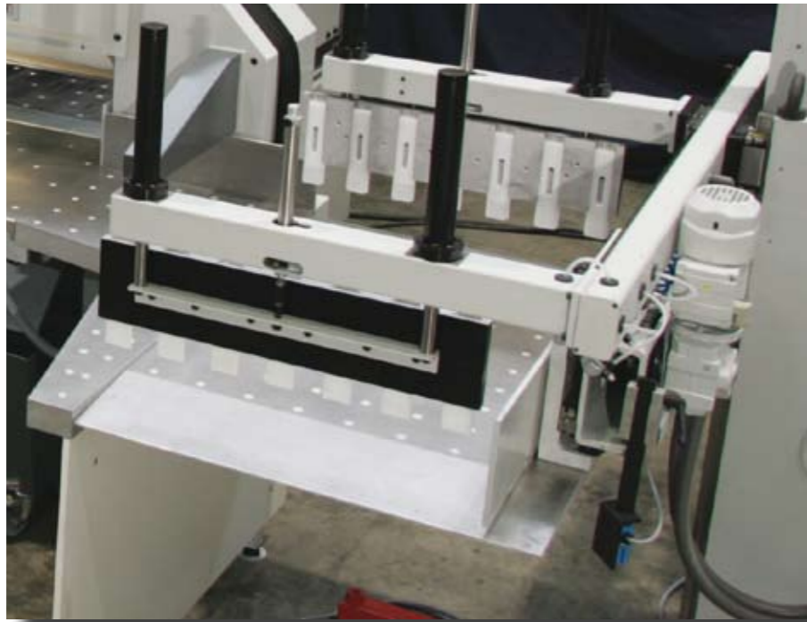
Compact and reasonably priced: Restacker xx59