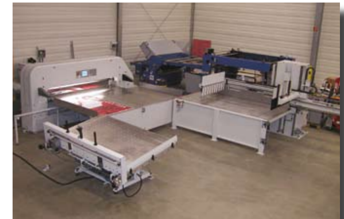
Cutting system with a restacker